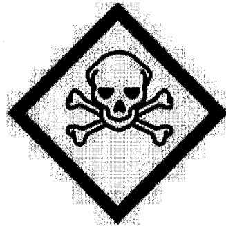
Acute oral toxicity